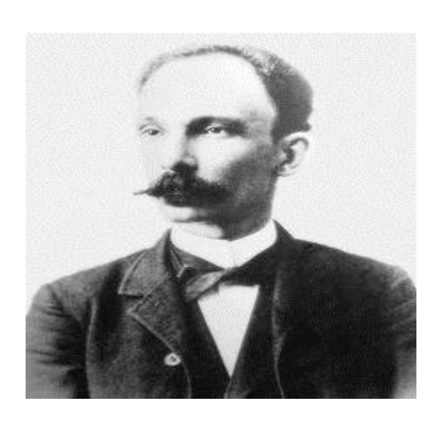
"To be educated is the only way to be free". José Martí.